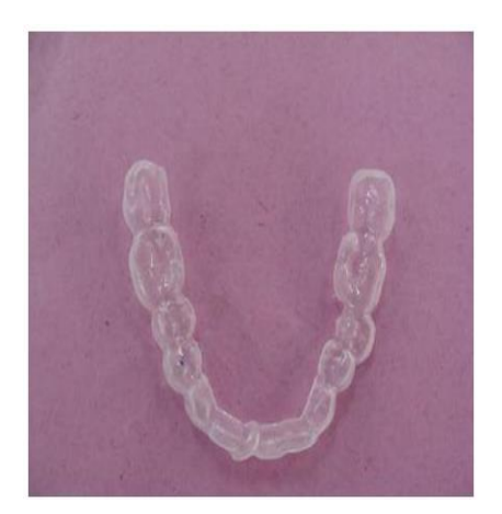
Figure 5: Soft splint

They also may increase temporomandibular joint loading [35] that results from greater maximum muscle efficiency. Splints do not prevent bruxism; they balance the force distribution to the entire masticatory system. They can decrease the frequency but not the intensity of bruxing episodes. Occlusal splints create neuromuscular balance by eliminating occlusal interferences and producing a change in the degree of tactile afferent impulses from the periodontal proprioceptive fibers [5, 36, 37]. It is believed that an occlusal appliance should be used to reduce forces to the retrodiscal tissues in the patients with permanent disk dislocation. On the other hand, few patients experienced remission with their disk remaining in a persistently displaced position [38].