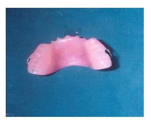
Figure 4: Posterior bite plane