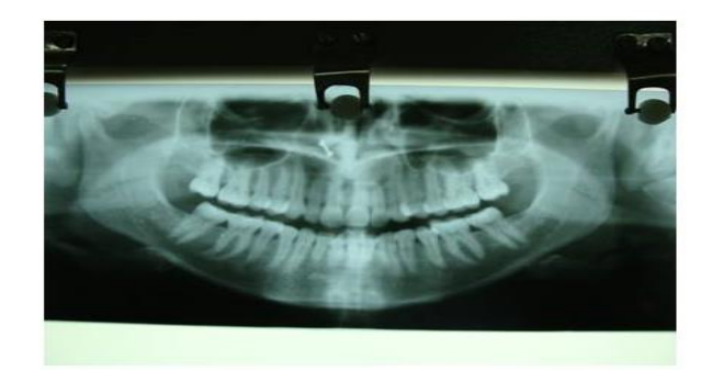
Figure 1: Orthopantogram