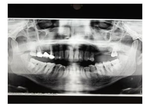
Figure 3: Orthopantogram